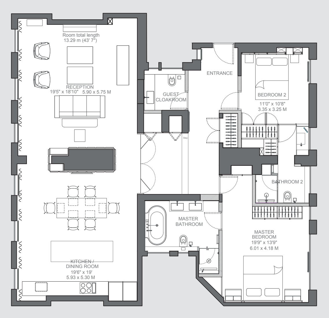
Approx. Gross Internal Area 1,828 sq ft (169.82 sq m) including all areas under 1.5m head height

For more information contact: Charles Hudson T +44 (0)20 7349 8920 E charles.hudson@obbard.co.uk obbard.co.uk The Yacht Club. Chelsea Harbour. London SW10 OXA