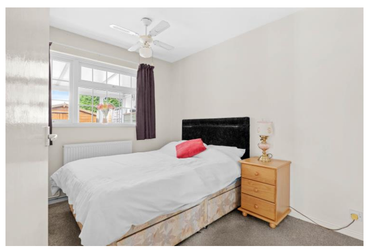
Bedroom Two 2.75m (9') max x 2.17m (7'1")