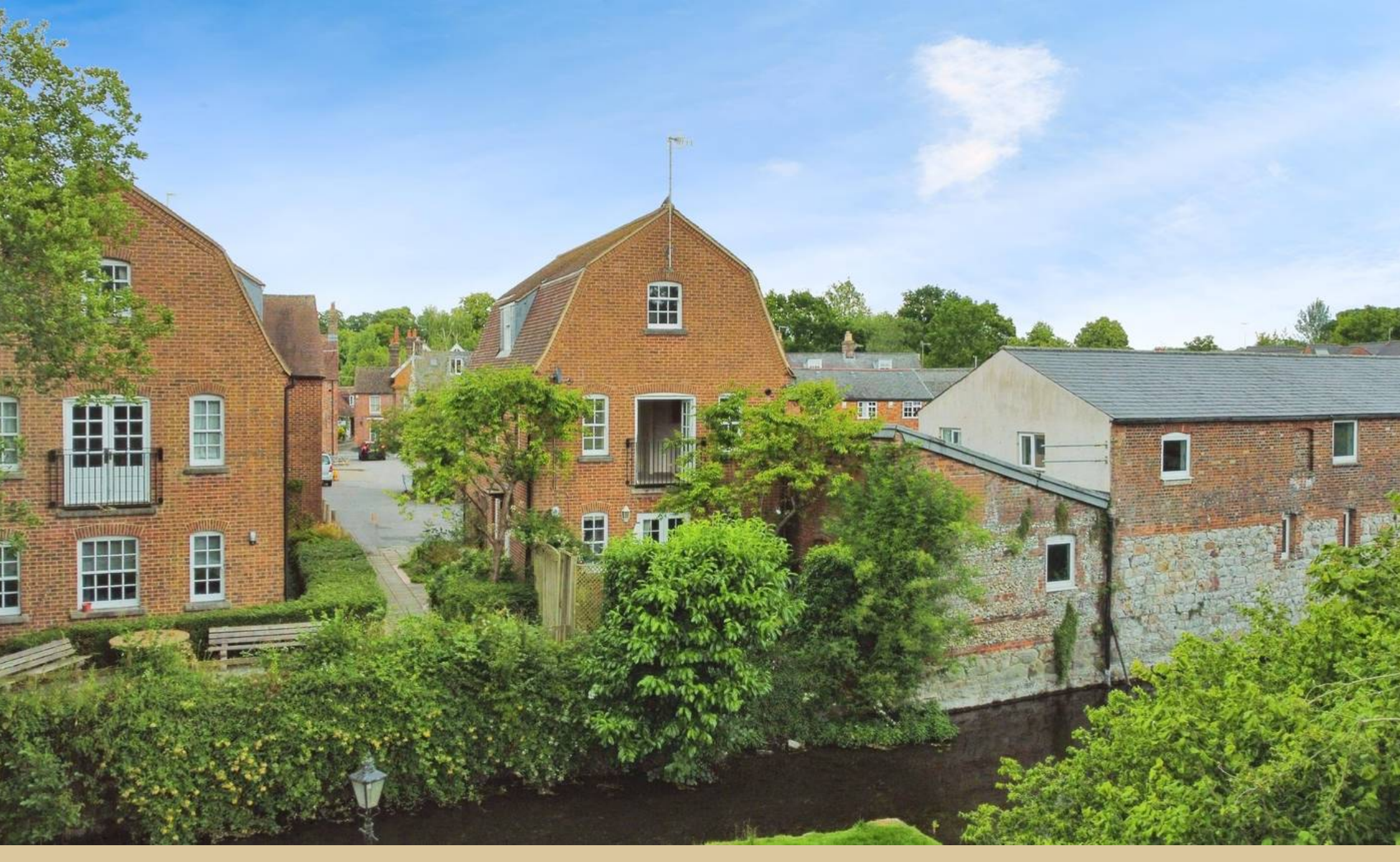
2 Harley Court London Road, Marlborough Guide Price £355,000