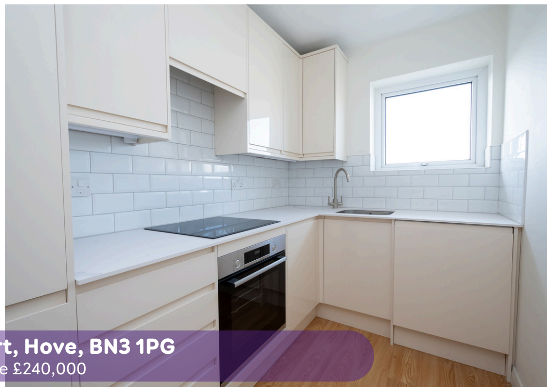
Furze Hill Court, Hove, BN3 1PG Asking Price £240,000