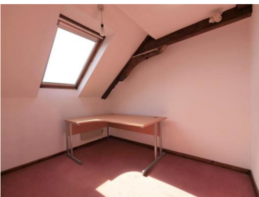
Stokebridge Maltings, Dock Street, Ipswich, IP2 8EU