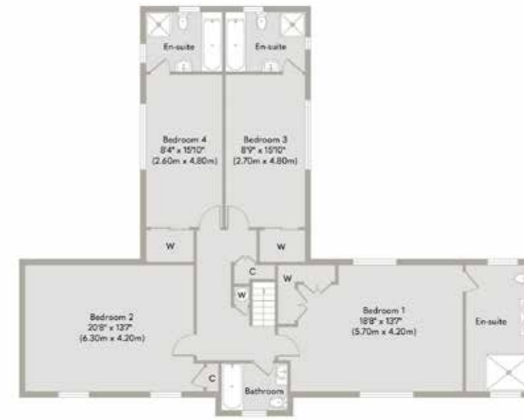
First Floor Approximate Floor Area 1,412 sq. ft (131.22 sq. m)