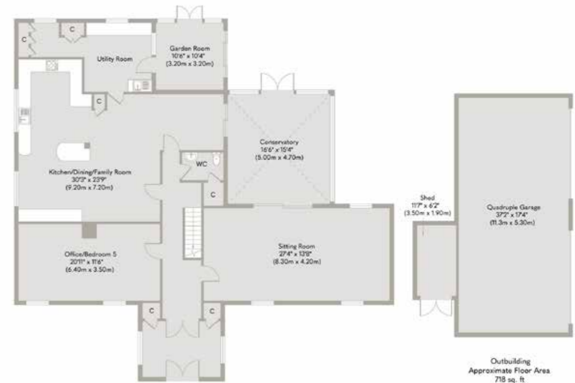
Ground Floor Approximate Floor Area 2,257 sq. ft (209.64 sq. m)