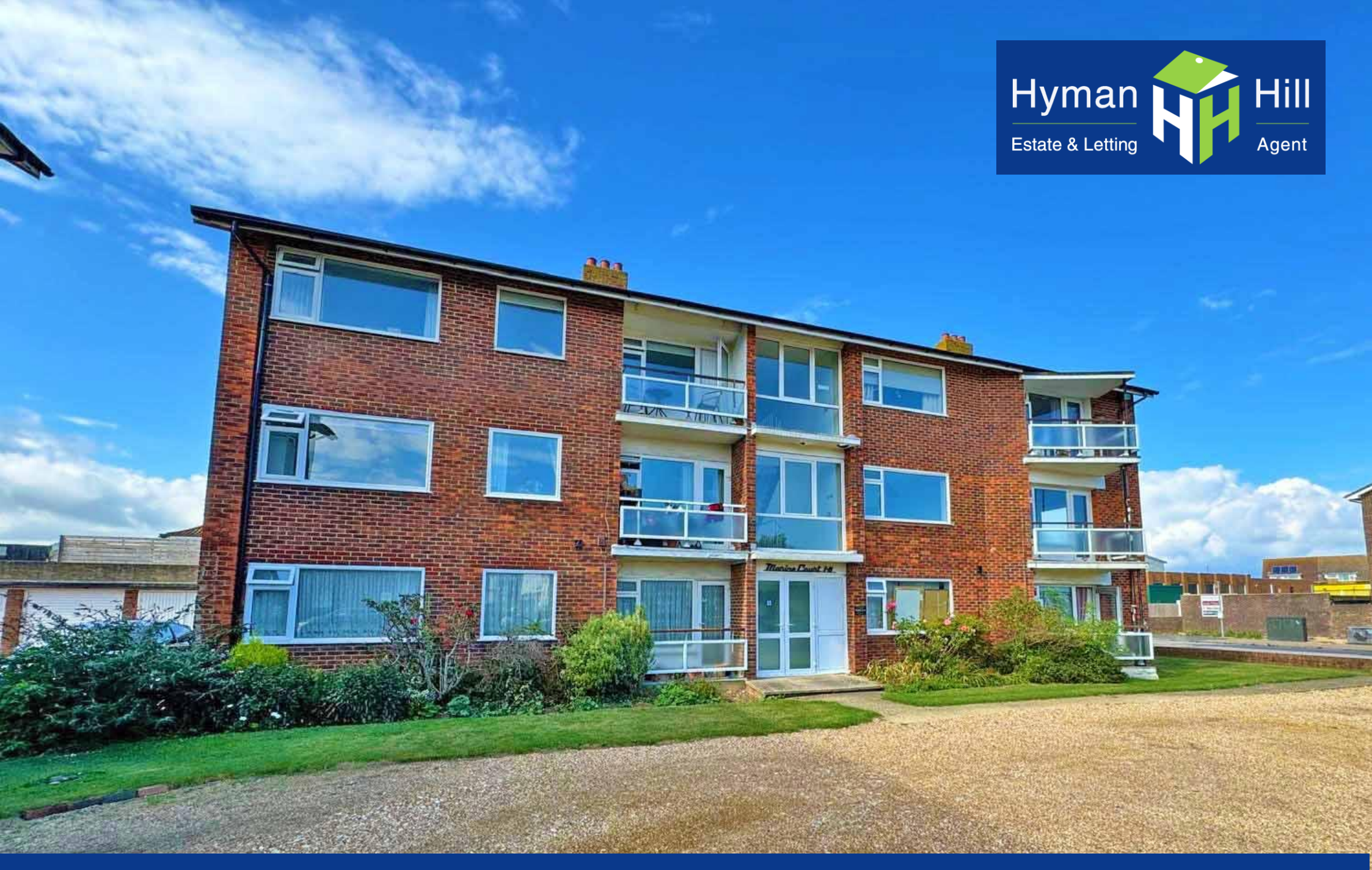
3 Marine Court, Beach Green, Shoreham Beach, West Sussex, BN43 5LQ