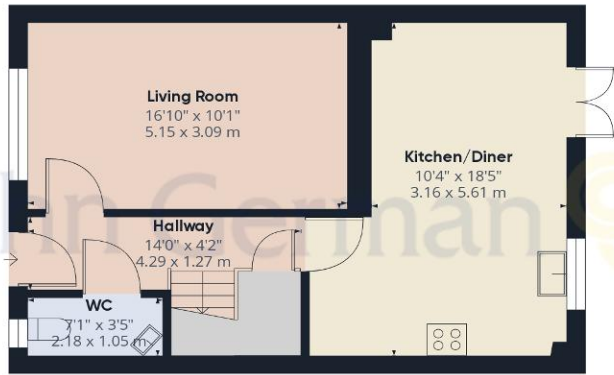
Ground Floor Building 1