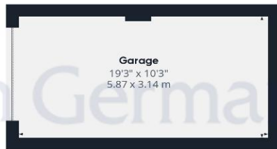
Ground Floor Building 2