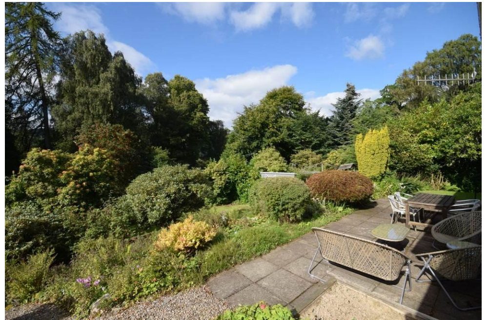
Next Home - 15 Dixon Terrace, Pitlochry, PH16 5QX