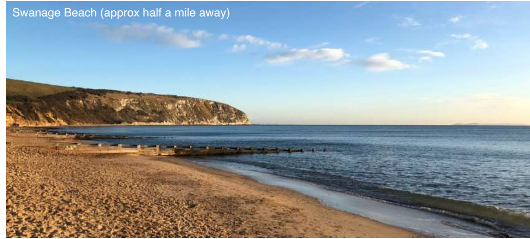
Swanage Beach (approx half a mile away)