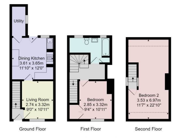
Total Area: 78.6 m² ... 846 ft² All measurements are approximate and for display purposes only. No liability is accepted by either the agency or Box Property Solutions Ltd as to the exact measurements of the rooms. Box Property Solutions Ltd retains the copyright on this plan and allows agents to use it with agreed permission.