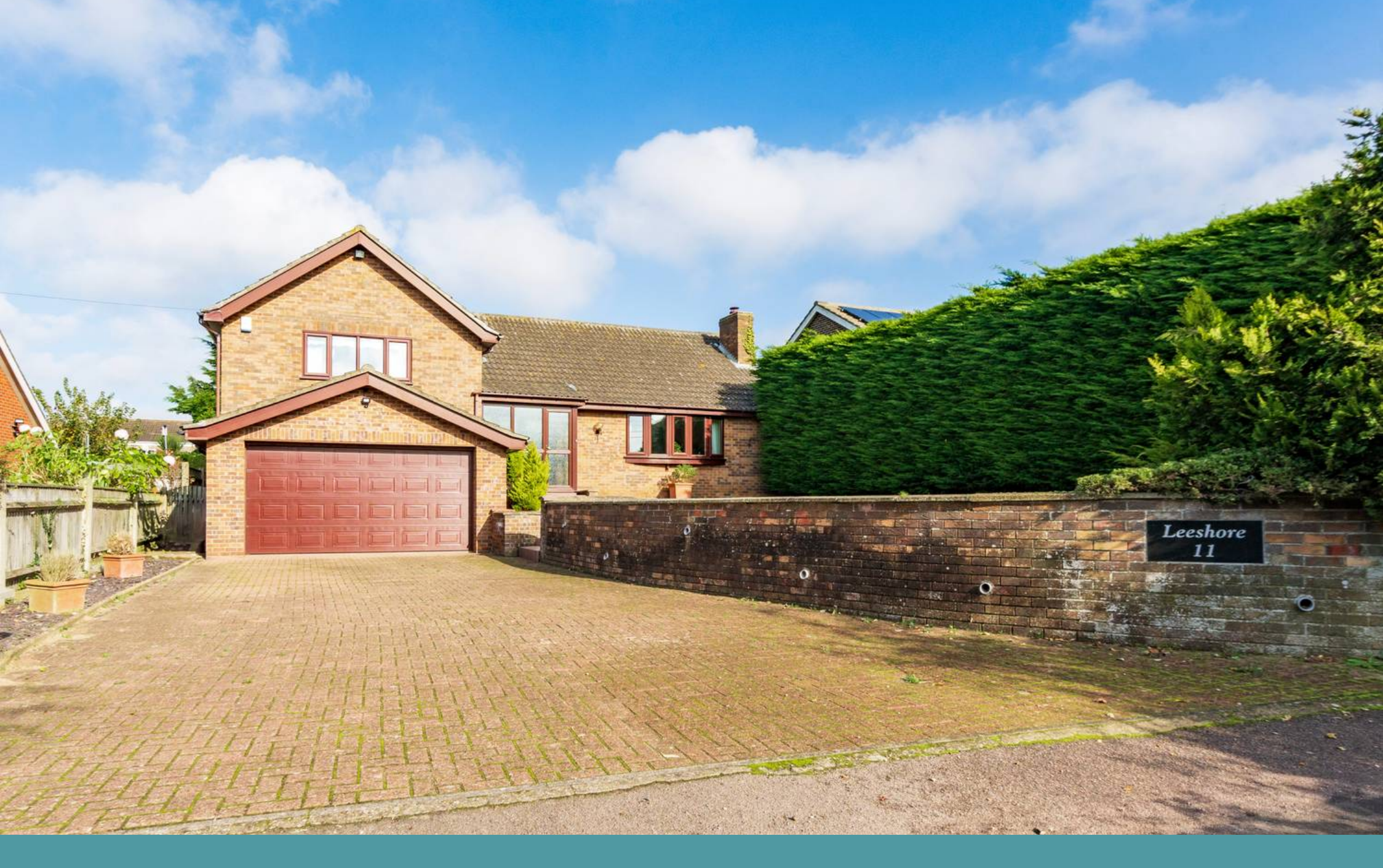
11 Hollow Lane, Carlton Colville