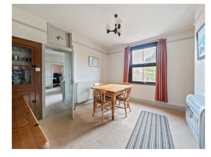
GENERAL REMARKS AND STIPULATIONS:

Tenure: The property is offered for sale freehold by private treaty with vacant possession on completion.