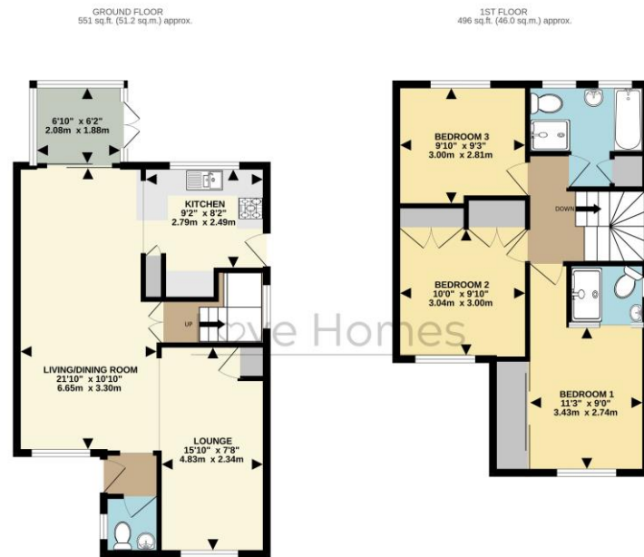
TOTAL FLOOR AREA - 1040 sq ft. (97.2 sq.m.) approx. Drawn by Love Homes for illustrative purposes only. Measurements and areas shown are approximate. Made with Metagen 12/20.