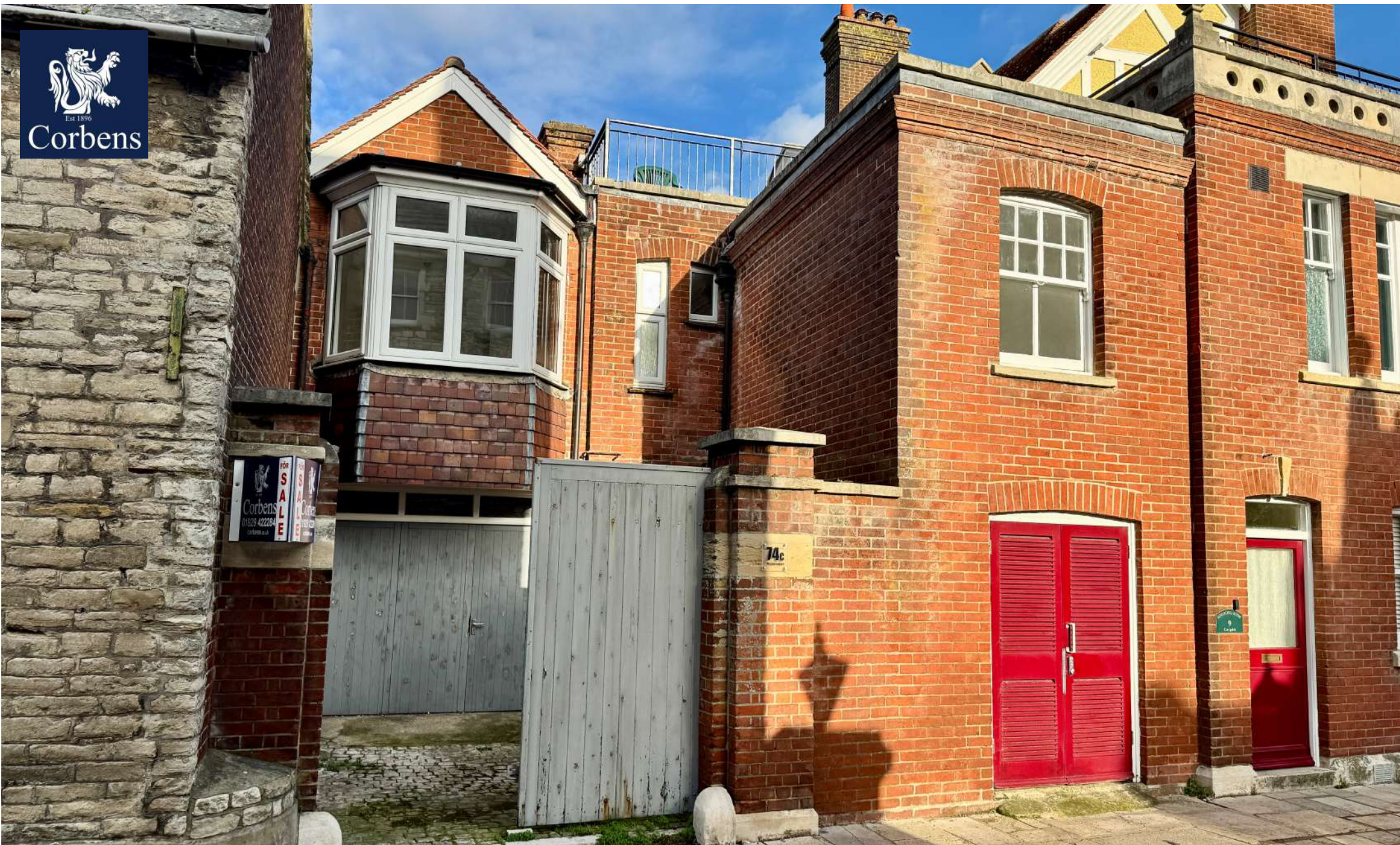
THE COACH HOUSE, 74C HIGH STREET, SWANAGE GUIDE PRICE £485,000 FREEHOLD