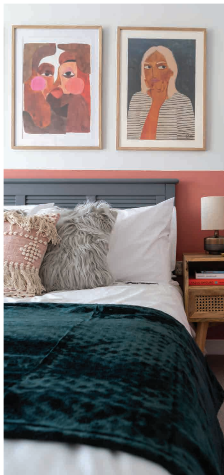
1 2 3 East Wick + Sweetwater Phase 1