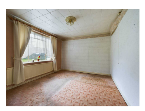
Energy Efficiency rating: F Council Tax band: D Tenure: Freehold