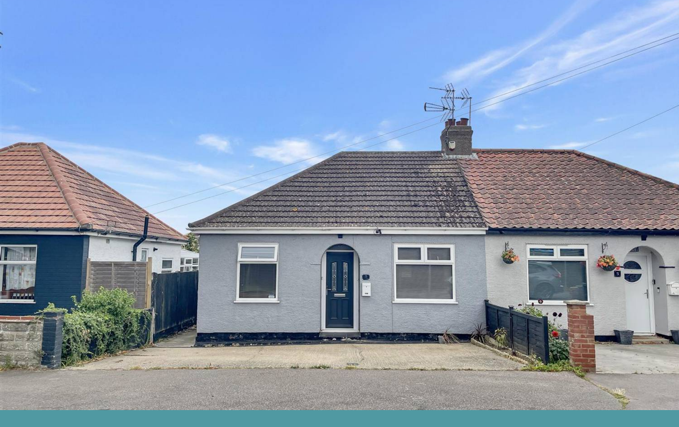
3 Dell Road East, Lowestoft