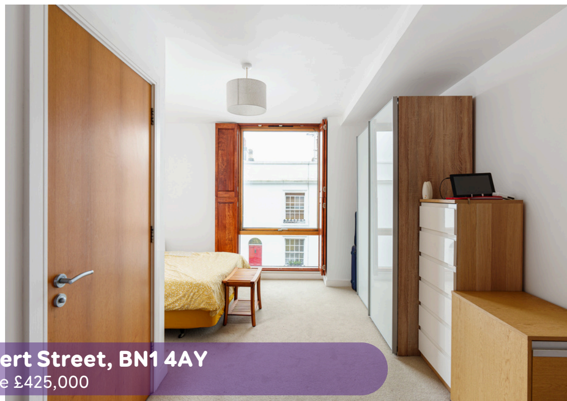
Argus Lofts, Robert Street, BN1 4AY Asking Price £425,000