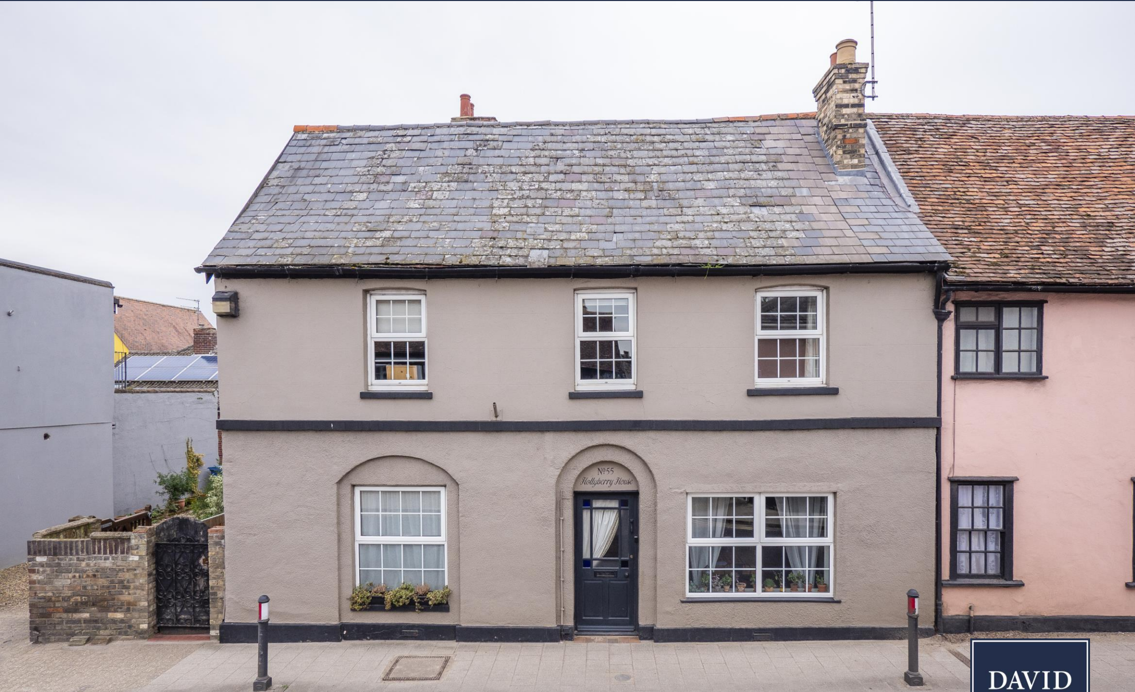
Hollyberry House, 55 Cross Street, Sudbury, Suffolk