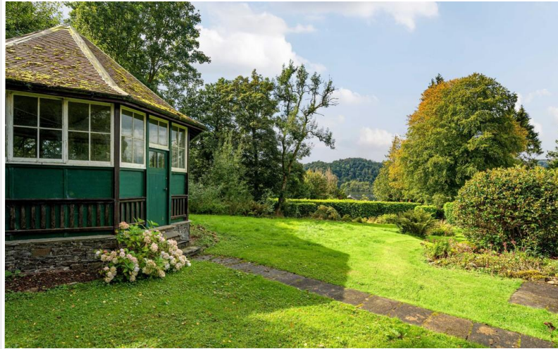
Communal garden and bandstand