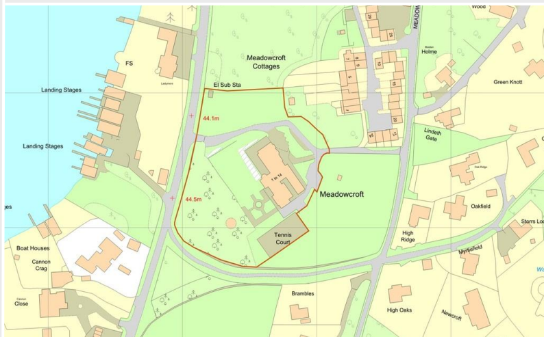
Ordnance Survey Plan