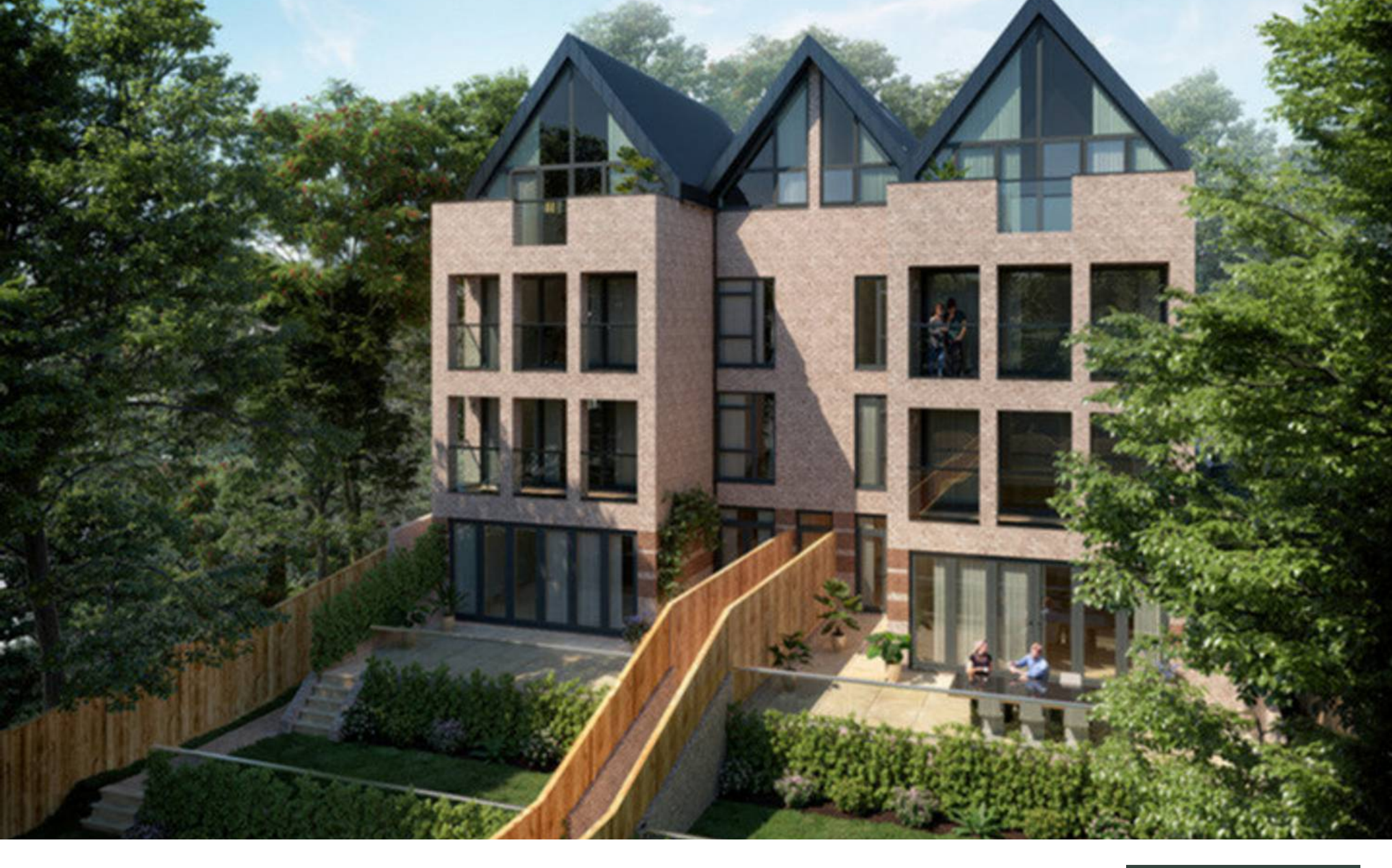
109, Honor Oak Park, London £775,000