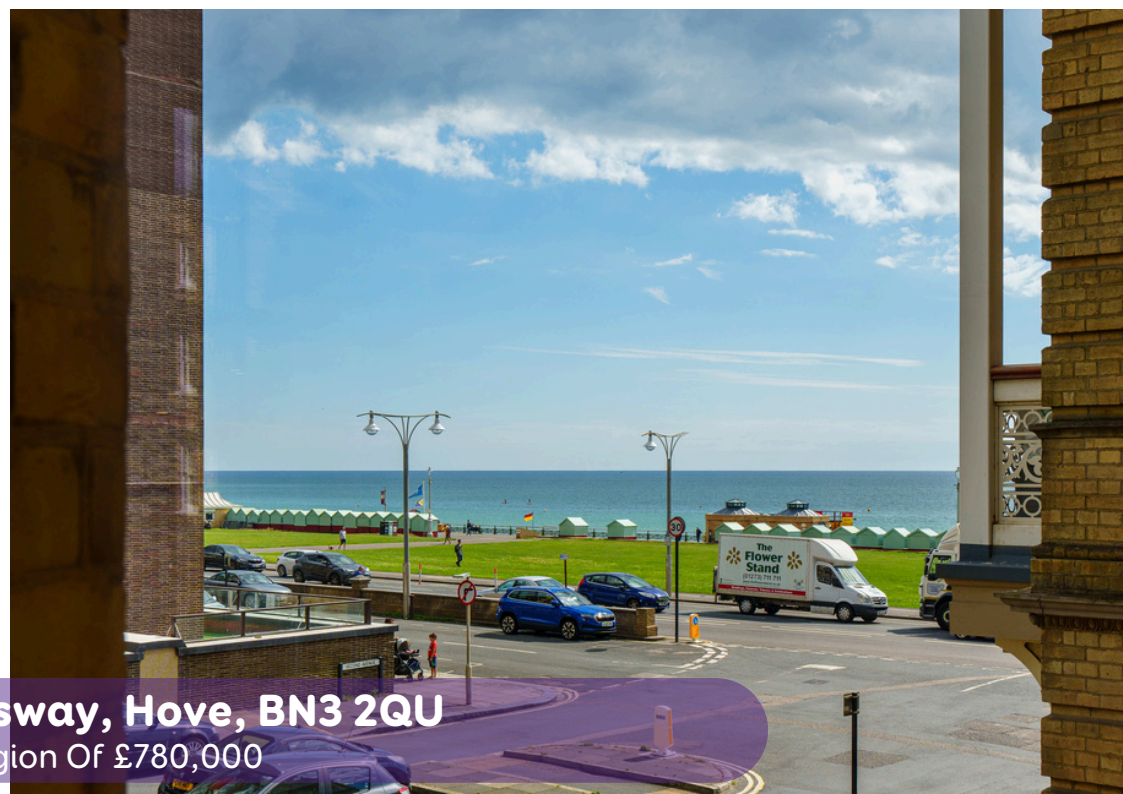
Kings House, Kingsway, Hove, BN3 2QU Offers In The Region Of £780,000