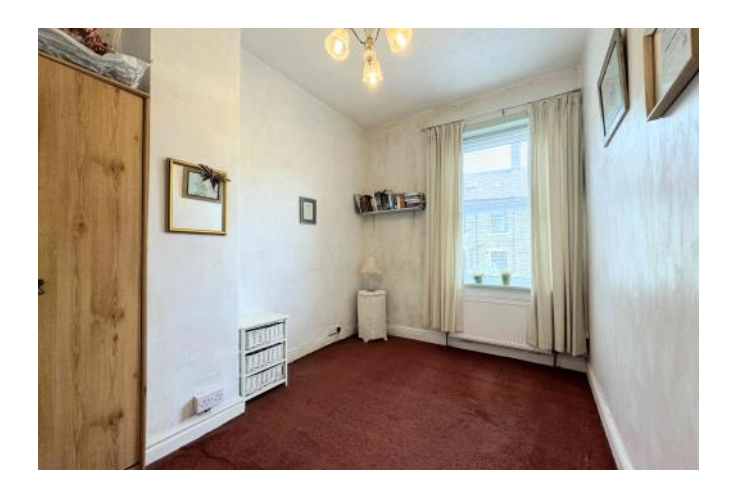
BEDROOM THREE 2.3 x 2.5m (7'6 x 8'2)