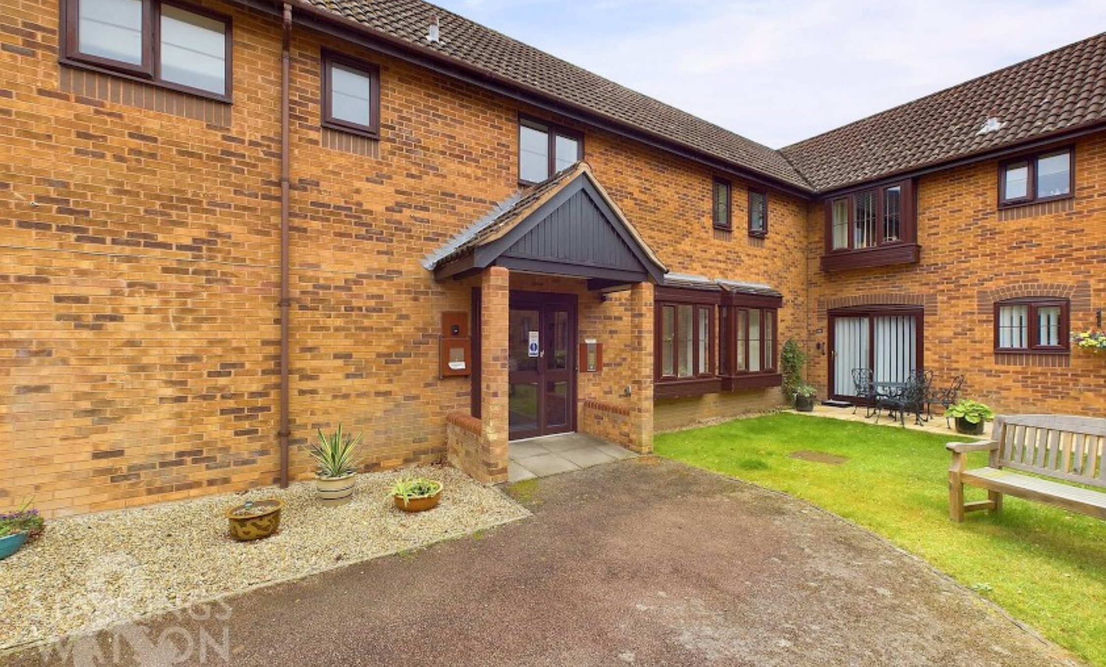
Laurel Court Armstrong Road, Norwich - NR7 9LS