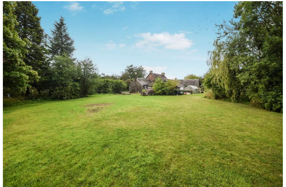
Next Home - The Croft, School Road, Guildtown, Perth, PH2 6BX