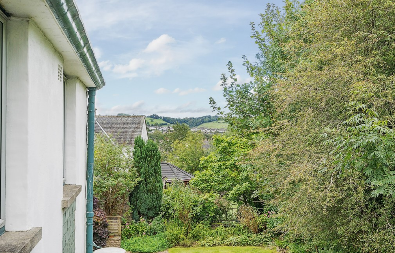
Views from the Balcony