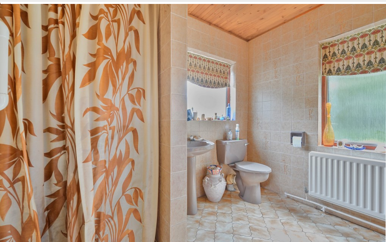
Downstairs Shower Room

Property Overview: The vibrant market town of Kendal offers seven primary schools, along with two highly regarded secondary schools: Kirkbie Kendal School and The Queen Katherine School. The town is also home to the high-achieving Kendal College.