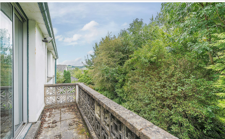
Bedroom One Balcony