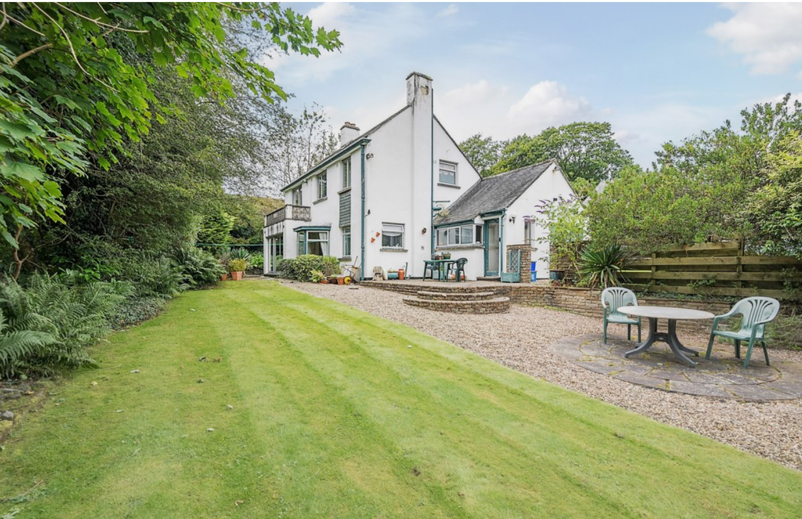
Rear Aspect and Garden