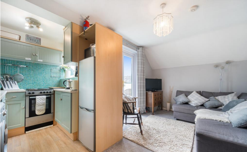
Open Plan Lounge/Kitchen