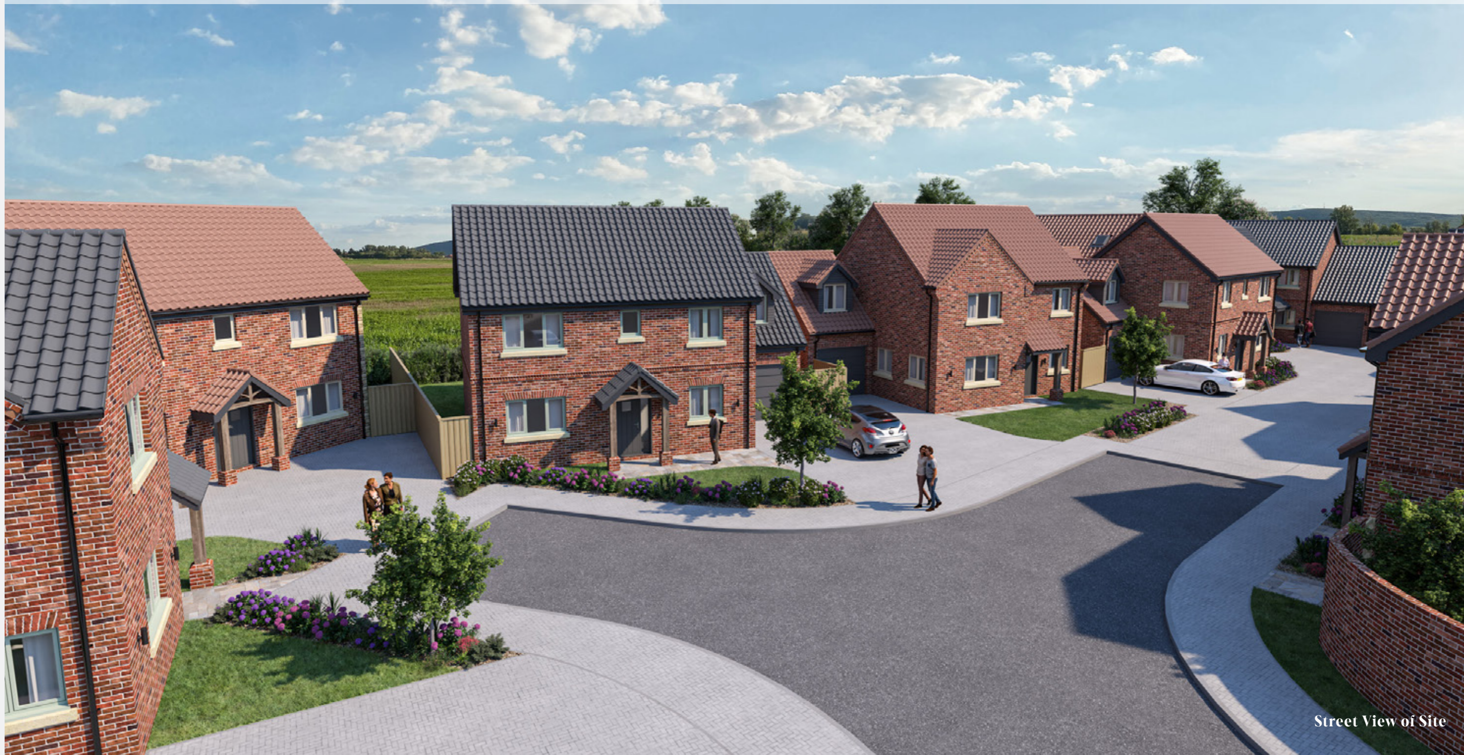
Street View of Site

Discover your new-build home amongst the seven property types available.