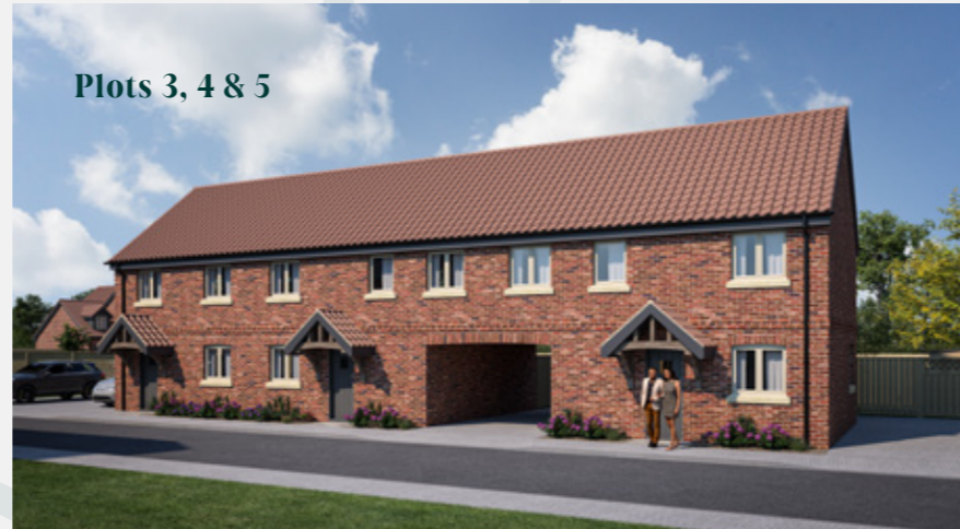
Plots 3, 4 & 5