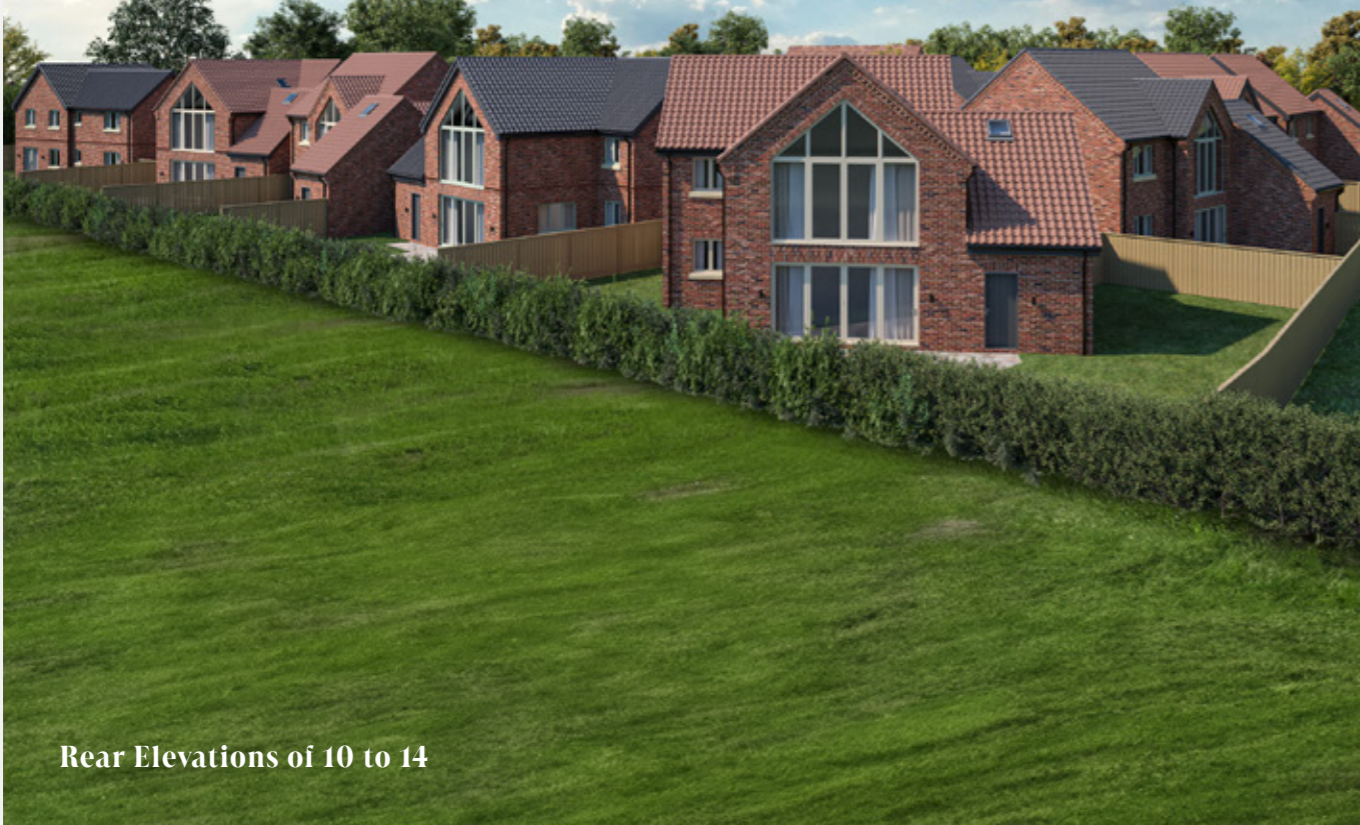
Rear Elevations of 10 to 14

With this extensive experience their management team has cultivated strong relationships with professional advisors, agents, and contractors. Their track record is a testament to their reliability and integrity, ensuring that every project they undertake meets the highest standards.