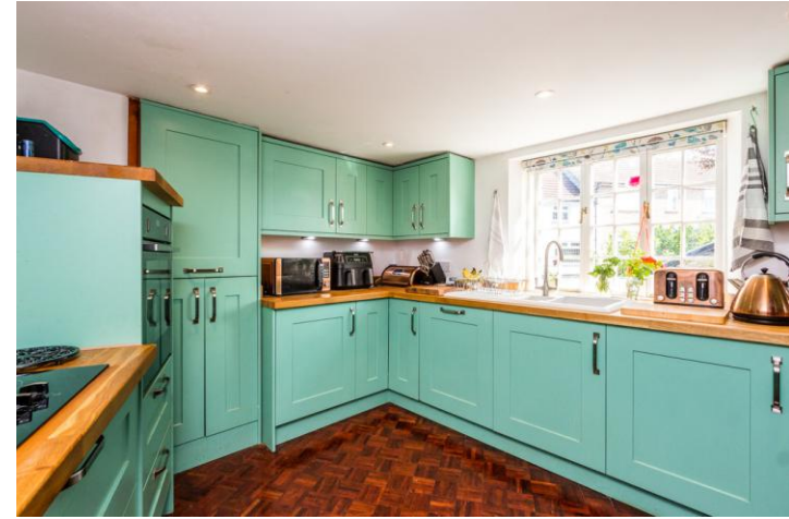
The Green, Chelveston, NN9 6AJ Freehold Price £268,000

Wellingborough Office 27 Sheep Street Wellingborough Northants NN8 1BS 01933 224400