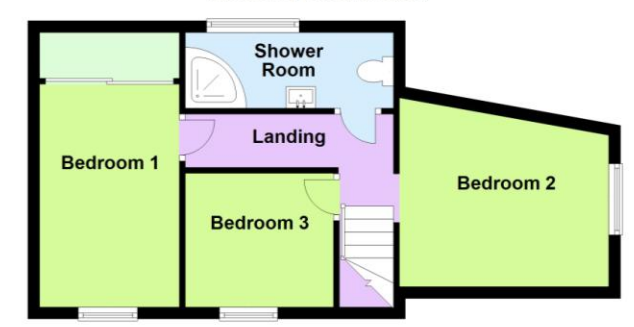
Total area: approx. 77.9 sq. metres (838.4 sq. feet)

Approx. 38.9 sq. metres (419.2 sq. feet)