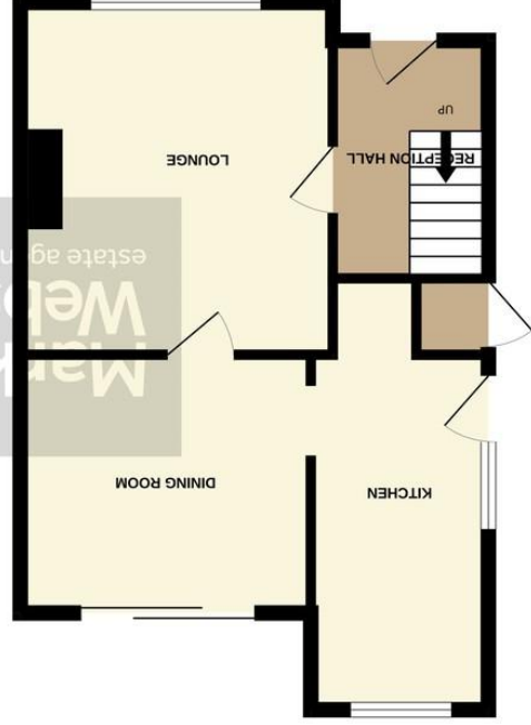
GROUND FLOOR (38.8 sq.m.) approx.