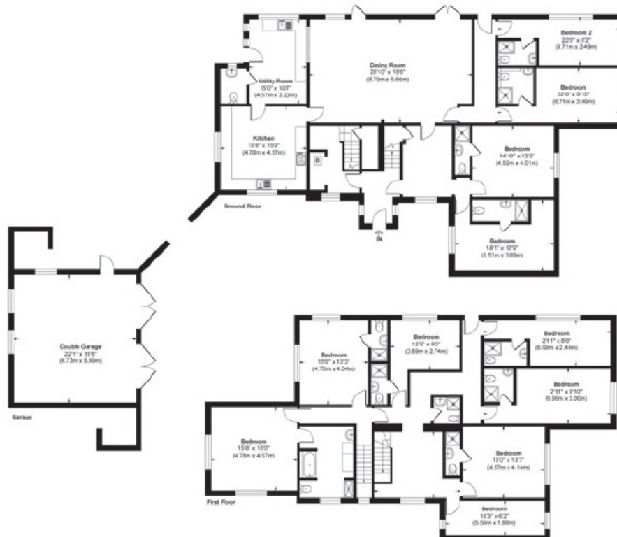
Illustration for identification purpose only, measurements approximate, and not to scale.

Approximate Gross Internal Area = 453.0 sq m / 4873 sq ft (Including Outbuilding)