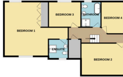
1ST FLOOR 916 sq ft. (85.1 sq.m.) approx.