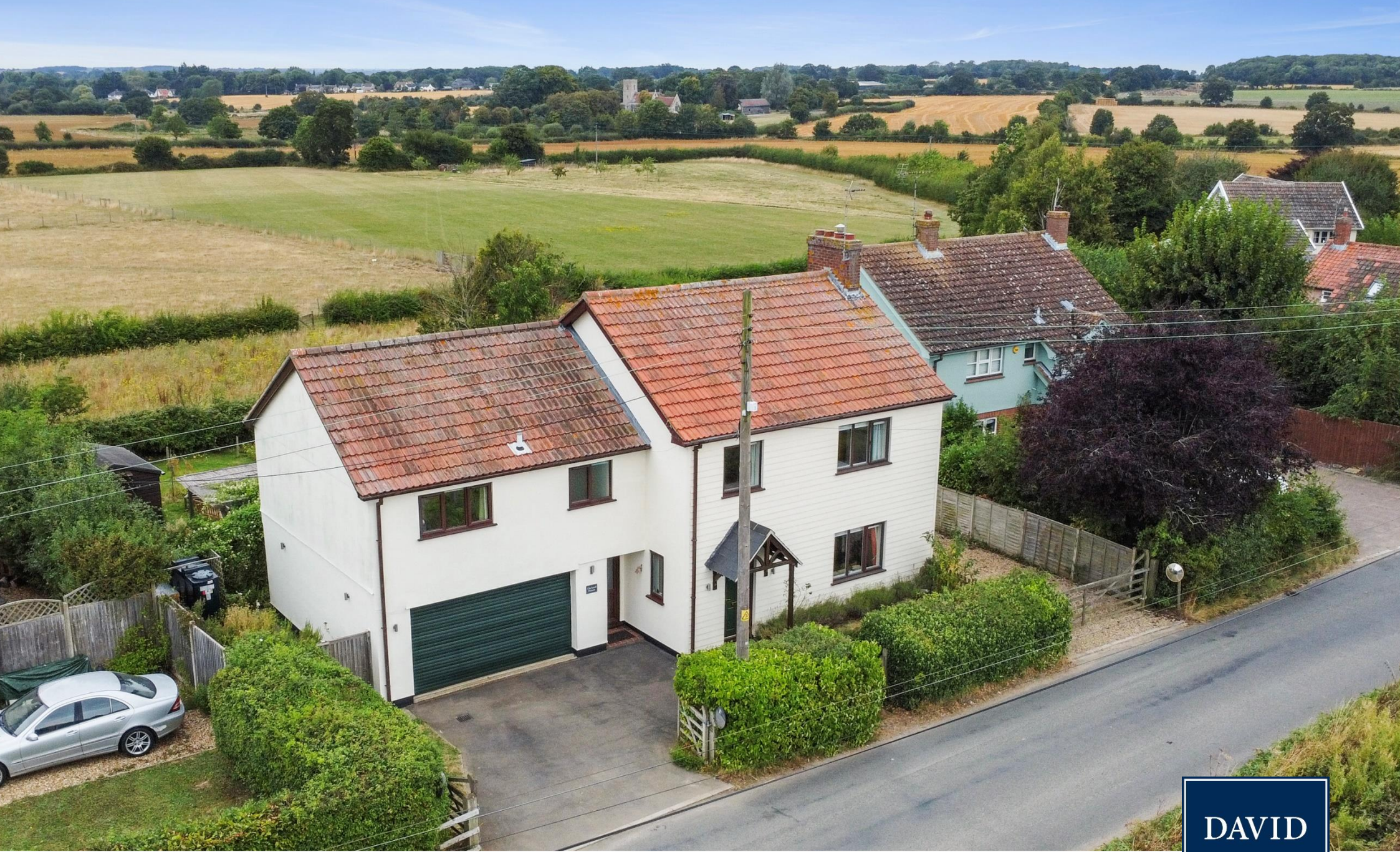
Orchard House Norton, Suffolk