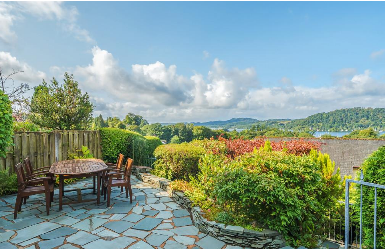
Patio seating area