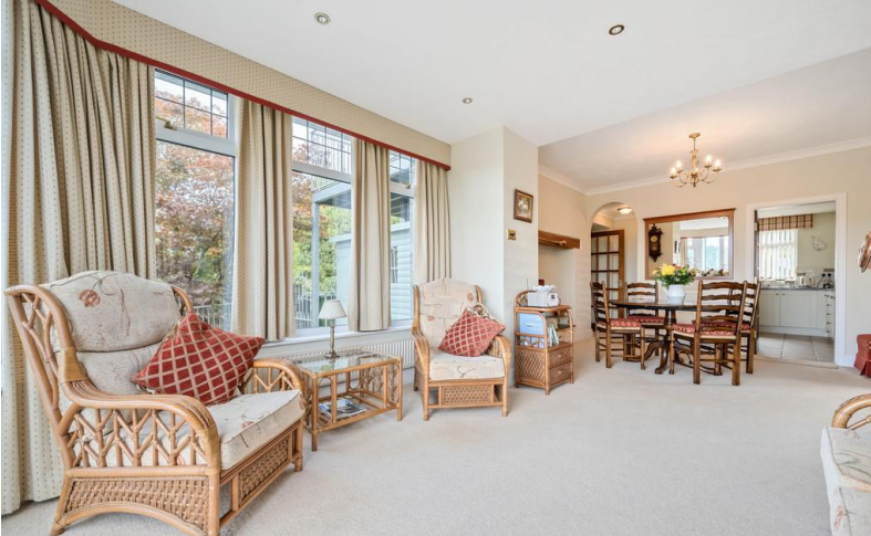
Conservatory and dining area