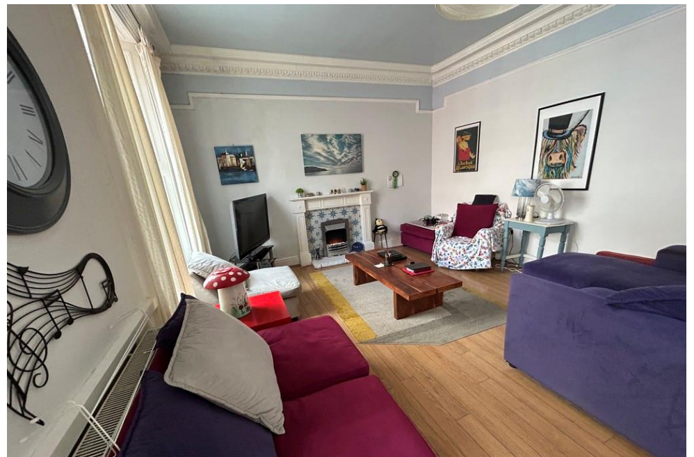
Next Home - 15a Atholl Street, Perth, PH1 5NH