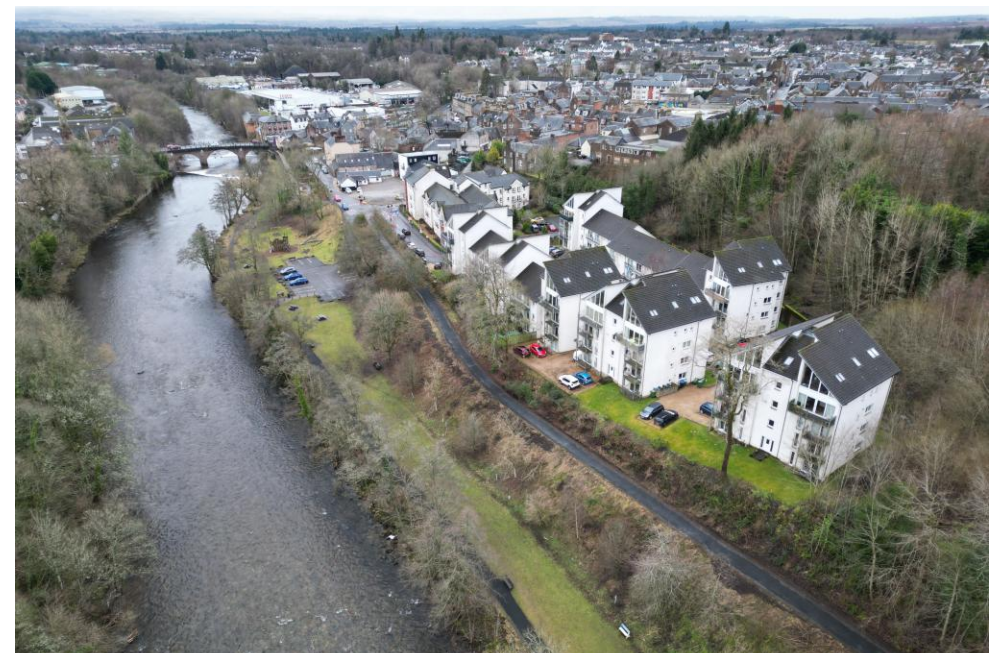
Next Home - 60 Riverside Park, Blairgowrie, PH10 6GB