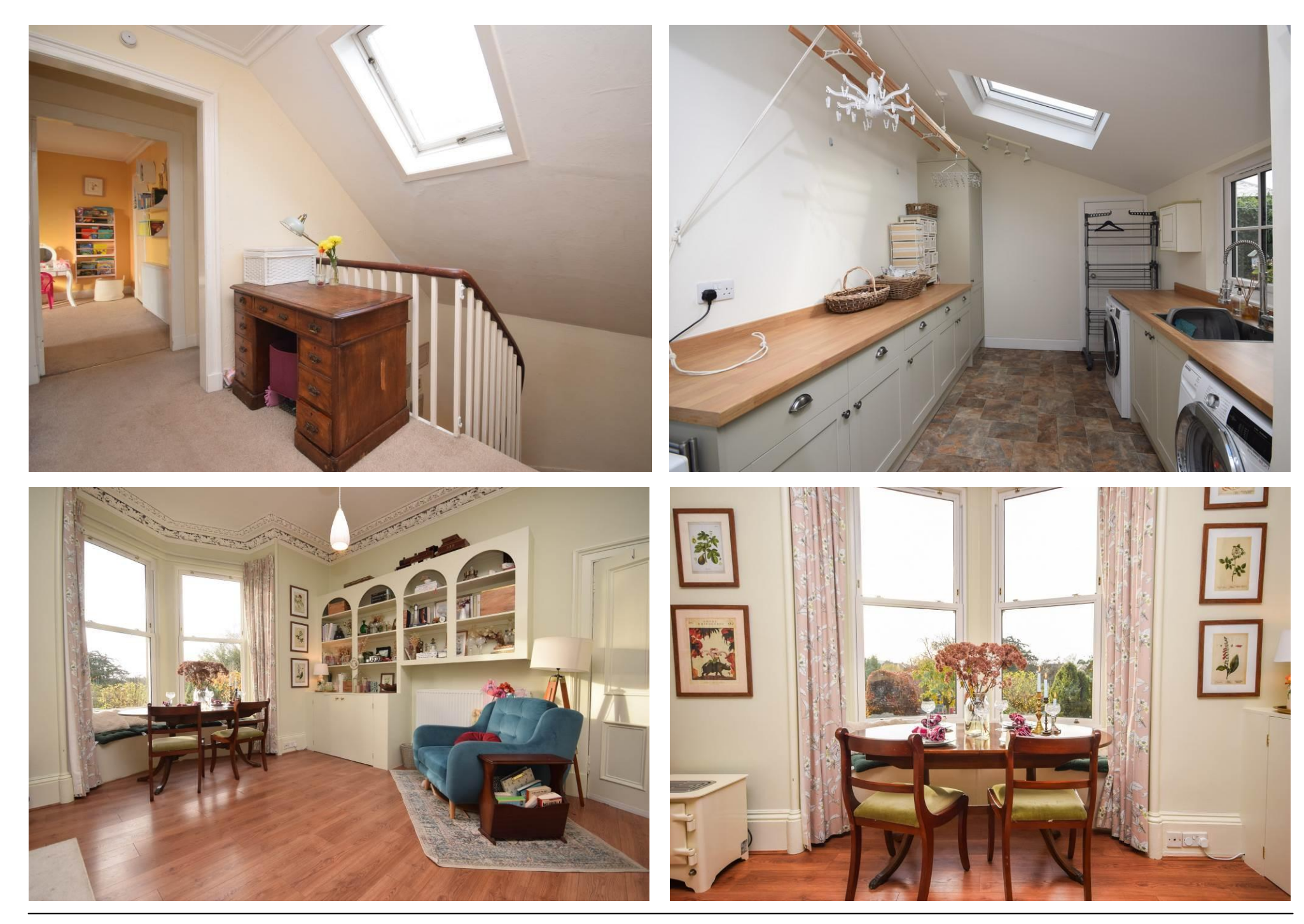
Next Home - 12 Murray Road, Scone, Perth, PH2 6RQ