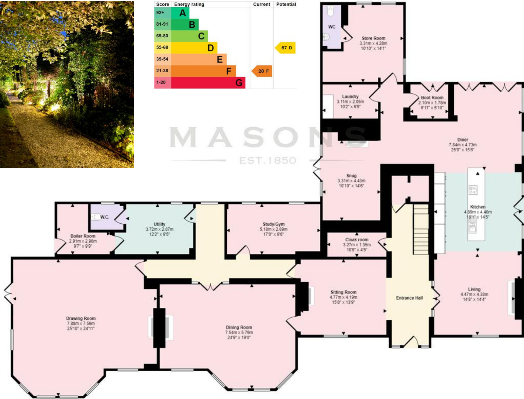
Ground Floor Approx 336 sq m / 3613 sq ft