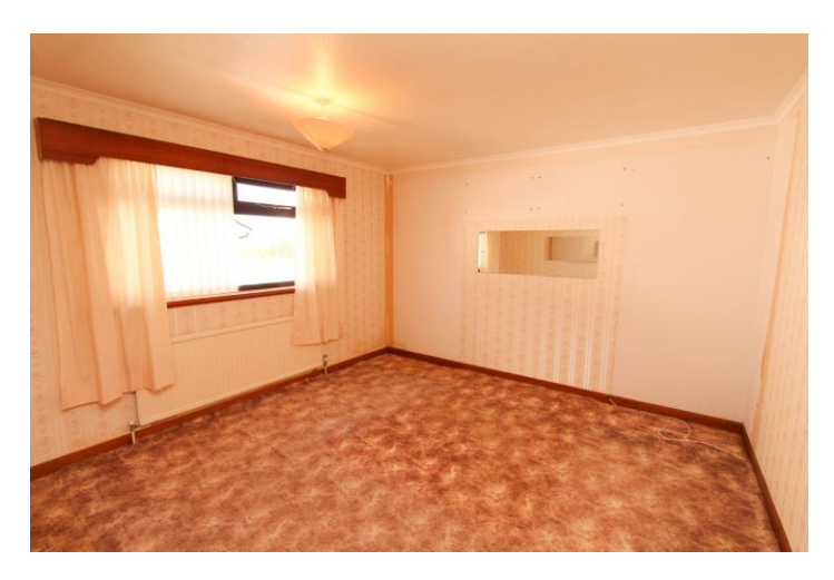
BEDROOM 3: A bedroom to the front with CH radiator and TV point.