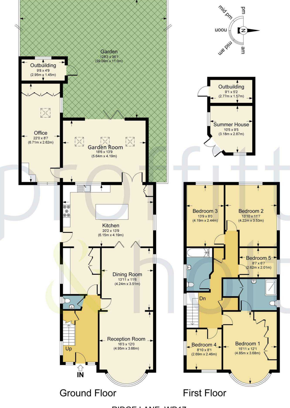
RIDGE LANE, WD17