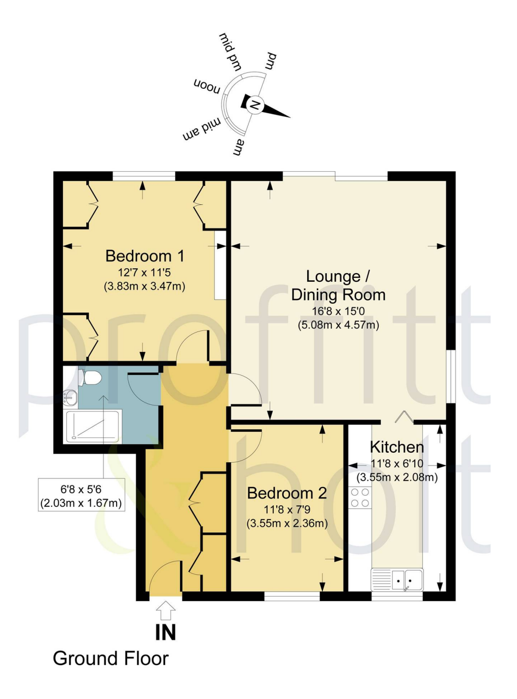
11 Roseberry Court, WD17