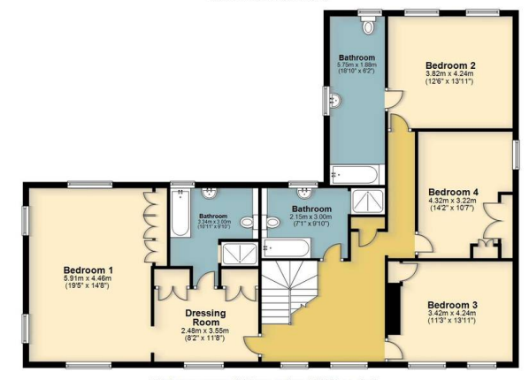
Total area: approx. 358.6 sq. metres (3860.4 sq. feet)