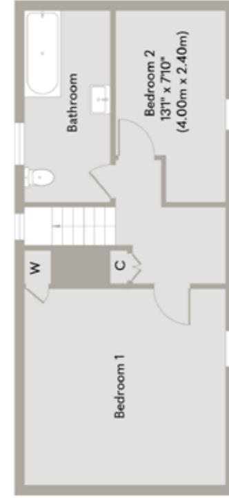
First Floor Approximate Floor Area 448 sq. ft (41.58 sq. m)

Whilst every attempt has been made to ensure the accuracy of the floor plan contained here, measurements of doors, windows, rooms and any other items are approximate and no responsibility is taken for any error, omission, or mis-statement. This plan is for illustrative purposes only and should be used as such by any prospective purchaser or tenant. The services, systems and appliances shown have not been tested and no guarantee as to their operability or efficiency can be given.