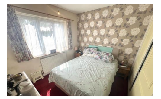
Alexandra Close, Harrow, , HA2 8QA