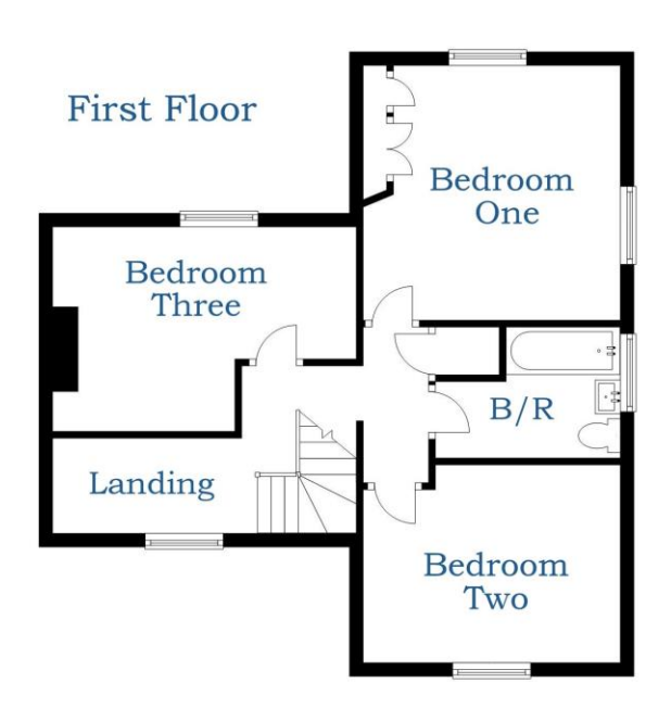
Grier & Partners - 2024