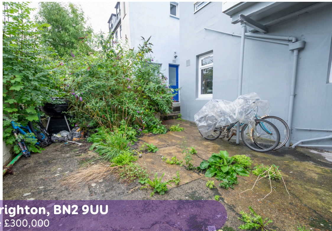
Finsbury Road, Brighton, BN2 9UU Asking Price £300,000