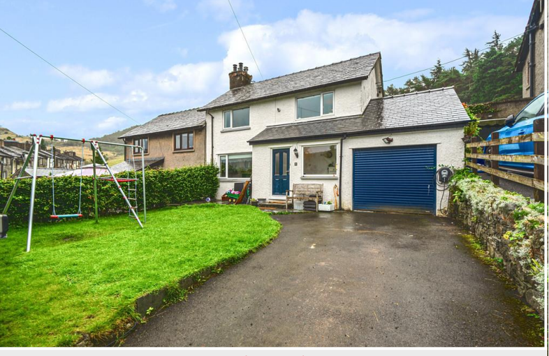
Front Garden and Driveway

consent' - meaning there could be a possibility of purchasing this property as a permanent residence even if you do not comply with the stated local occupancy clause.