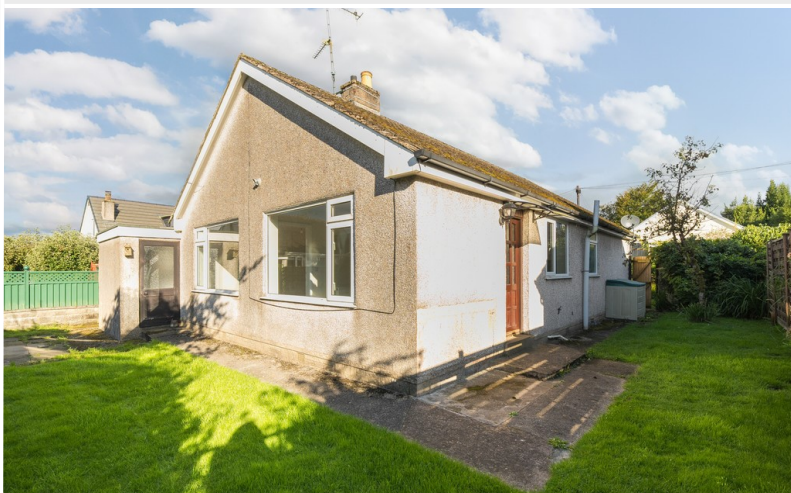
Rear garden and aspect