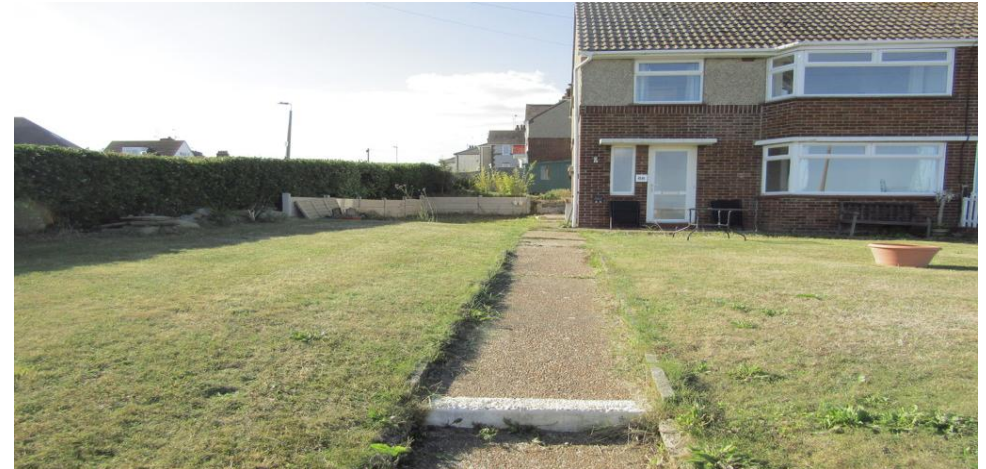
Harbour Crescent Harwich